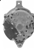
OEM Ford 2G Int Regulator 1987-93