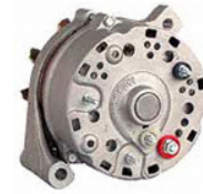
OEM Ford External Regulator 1965-86